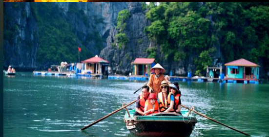
Experience with Bamboo boat